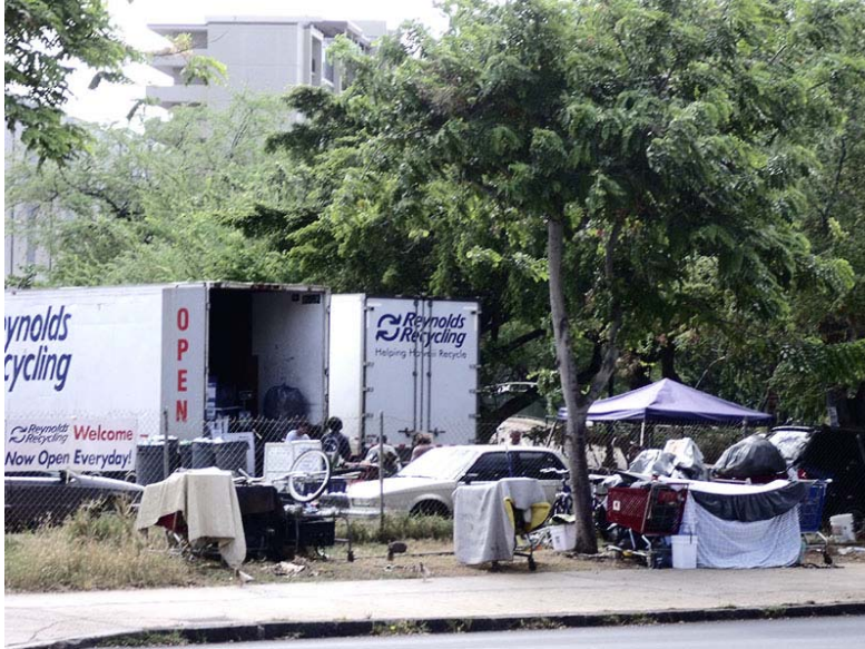
Hawai'i Convention Center is squeaky clean?